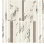
12x12 NAT | POL