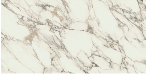
24x48 NAT RECT | POL RECT

Single Bullnose 3x12 NAT RECT | POL RECT