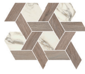
12x14 NAT | POL