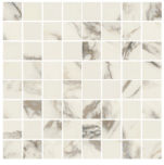
12x12 NAT | POL