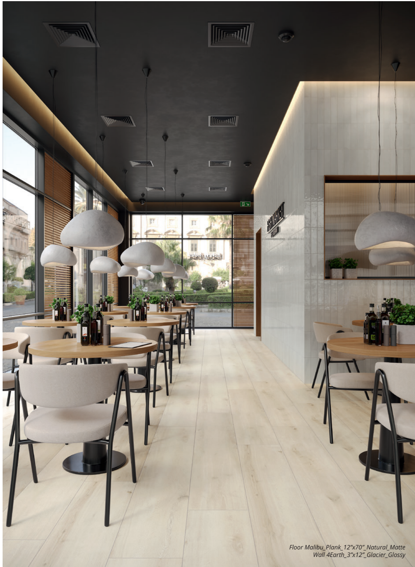
Floor Malibu_Plank_12"x70" Natural_Matte Wall 4Earth_3"x12" Glacier_Glossy