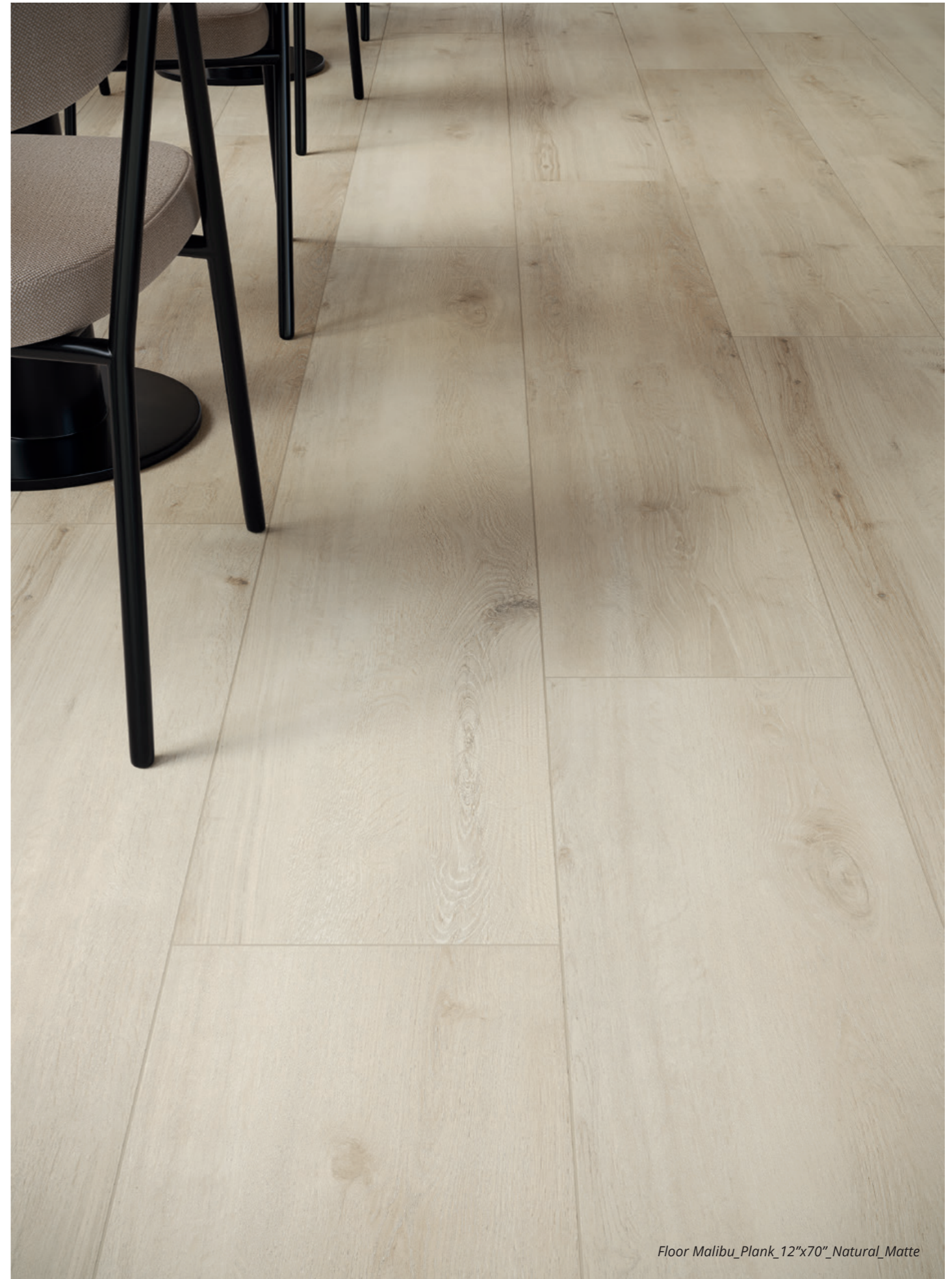
Floor Malibu_Plank_12"x70" Natural_Matte