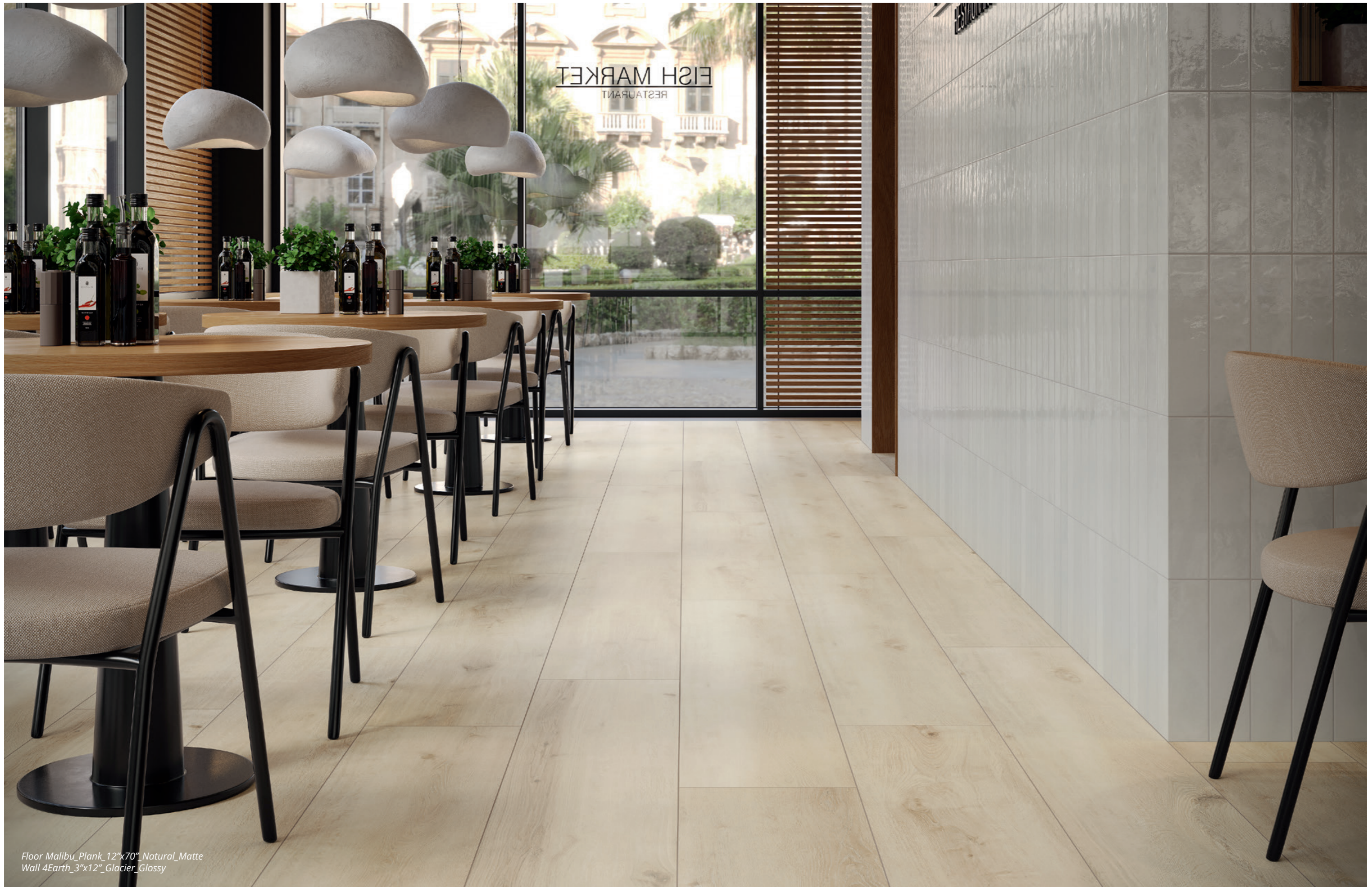
Floor Malibu_Plank_12"x70" Natural_Matte Wall 4Earth_3"x12" Glacier_Glossy