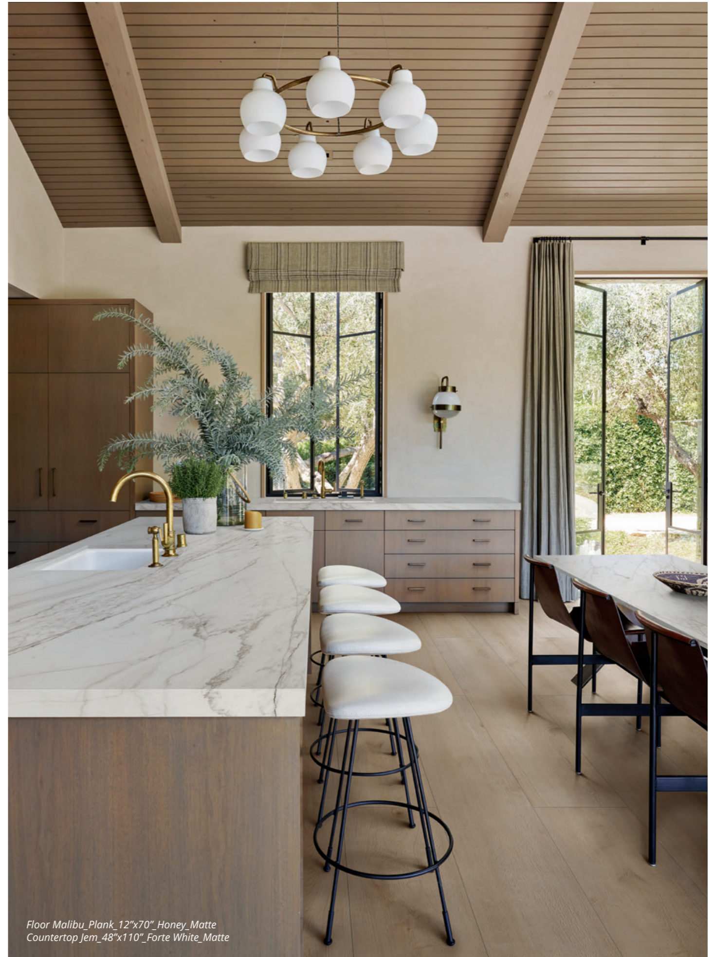
Floor Malibu_Plank_12"x70"_Honey_Matte Countertop Jem_48"x110"_Forte White_Matte