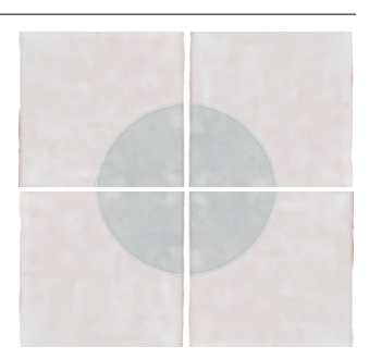
Eme Ash Chloe Decor MELEMECHL55

Eme Ash Audrey Decor MELEME55 MELEMEAUD55